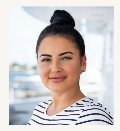
GISELLE BAARD SOUTH AFRICAN